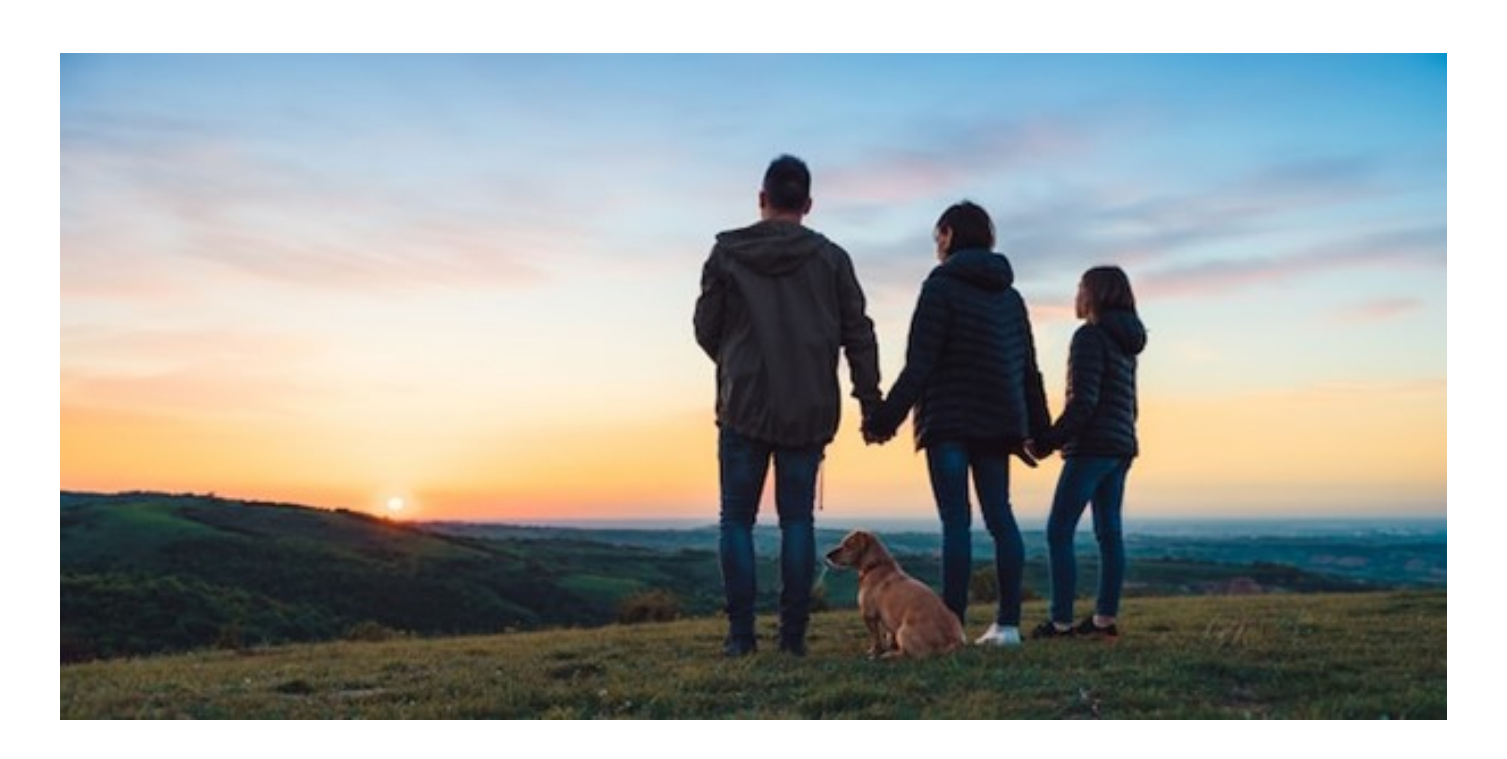
"To be in your children's memories tomorrow, you have to be in their lives today."